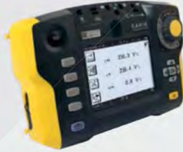
CHAUVIN ARNOUX - C.A 6116 Electrical Installation Tester