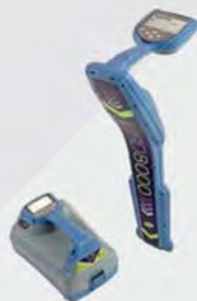
RADIODETECTION RD8000 PXL Cable/Pipe Locator