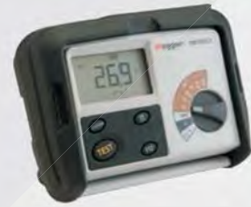
MEGGER DET4TC2 Portable Earth Resistance Meter