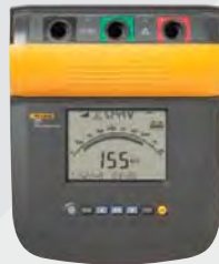
FLUKE 1555 Isolation Resistance Tester