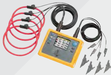
FLUKE 1735 Power Logger