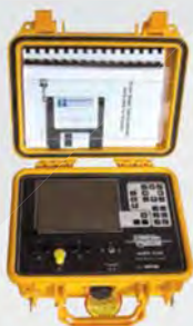
RISERBOND 1270A TDR for Telecom and CATV