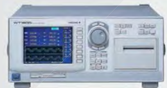
YOKOGAWA WT-1600 Real-Time precision Power Quality Analyser