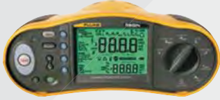
FLUKE 1654 Multifunction Installation Tester