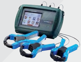
GMC-MAVOWATT 40 Power and disturbance Analyser