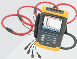
FLUKE 437 Logging Power Quality Analyser