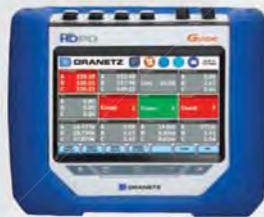
DRANETZ POWERGUIDE 4 Channel Power Quality Analyzer