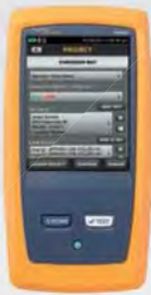
FLUKE DSX-5000 CableAnalyzer