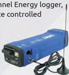
DENT INSTRUMENTS - ELITEPRO XC 3 channel Energy logger, remote controlled