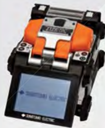
FUJIKURA FSM-70S Core Alignment Fusion Splicer