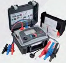
MEGGER MIT1025 10 kV diagnostic insulation resistance tester